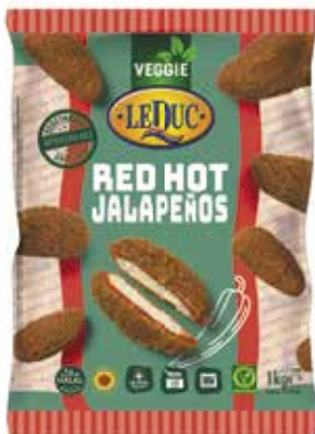
RED HOT JALAPEÑOS 6 x 1 kg/29 pcs.