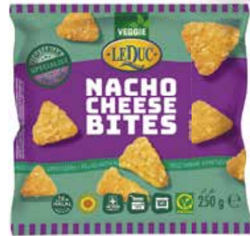
NACHO CHEESE BITES 12 x 250 g