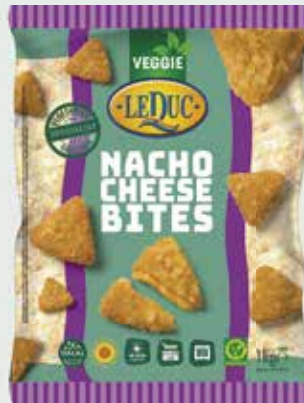
NACHO CHEESE BITES 6 x 1 kg/45 pcs.