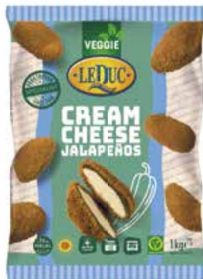
CREAM CHEESE JALAPEÑOS 6 x 1 kg/29 pcs.