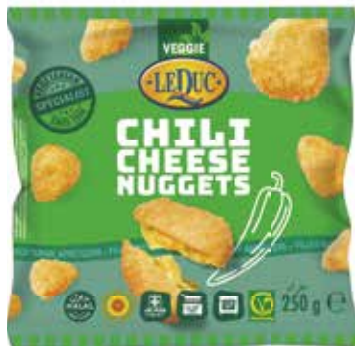
CHILI CHEESE NUGGETS 12 x 250 g