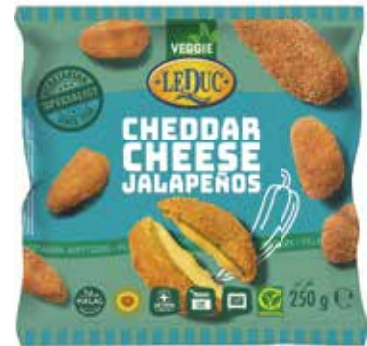
CHEDDAR CHEESE JALAPEÑOS 12 x 250 g