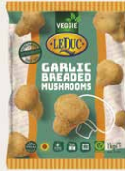
GARLIC BREADED MUSHROOMS 5 x 1 kg