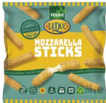
MOZZARELLA STICKS 12 x 250 g