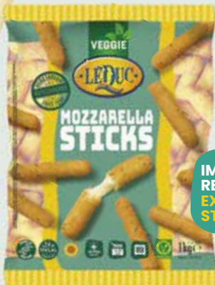
MOZZARELLA STICKS 6 x 1 kg/40 pcs.