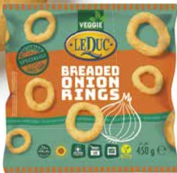
BREADED ONION RINGS 12 x 450 g