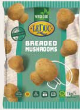
BREADED MUSHROOMS 5 x 1 kg