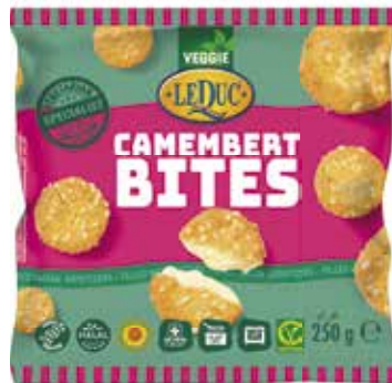
CAMEMBERT BITES 12 x 250 g