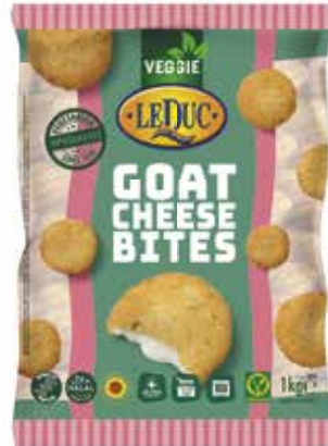
GOAT CHEESE BITES 6 x 1 kg/50 pcs.