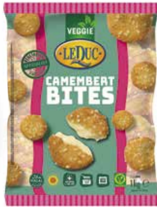
CAMEMBERT BITES 6 x 1 kg/50 pcs.