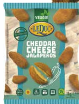
CHEDDAR CHEESE JALAPEÑOS 6 x 1 kg/29 pcs.