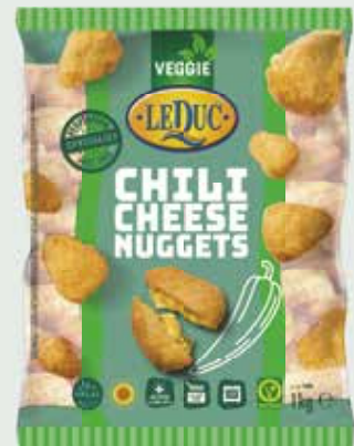
CHILI CHEESE NUGGETS 6 x 1 kg/50 pcs.

VEGETARIAN TREATS HAVE NEVER BEEN SO CHEESY